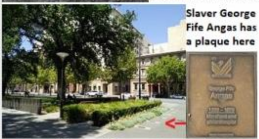
At Prince Albert Park driveway into North Terrace Adelaide: southern exit out of Government House